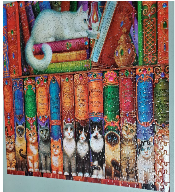
The 500 piece Cat Puzzle - Meow