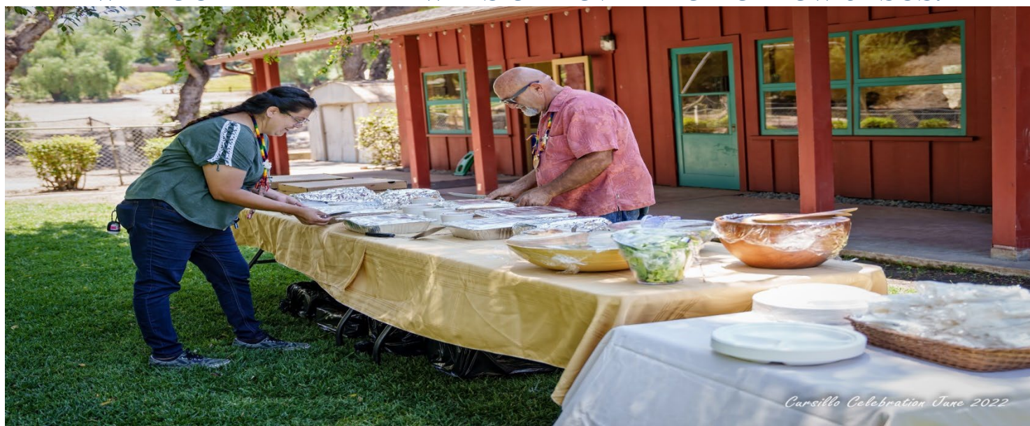
Cursillo Celebration June 2022

WE PLANNED OUR GROWTH – AND FOUND THE WAYS TO SERVE, AND WE FOUND THE MANY WAYS OF LOVE – TO FOLLOW JESUS.