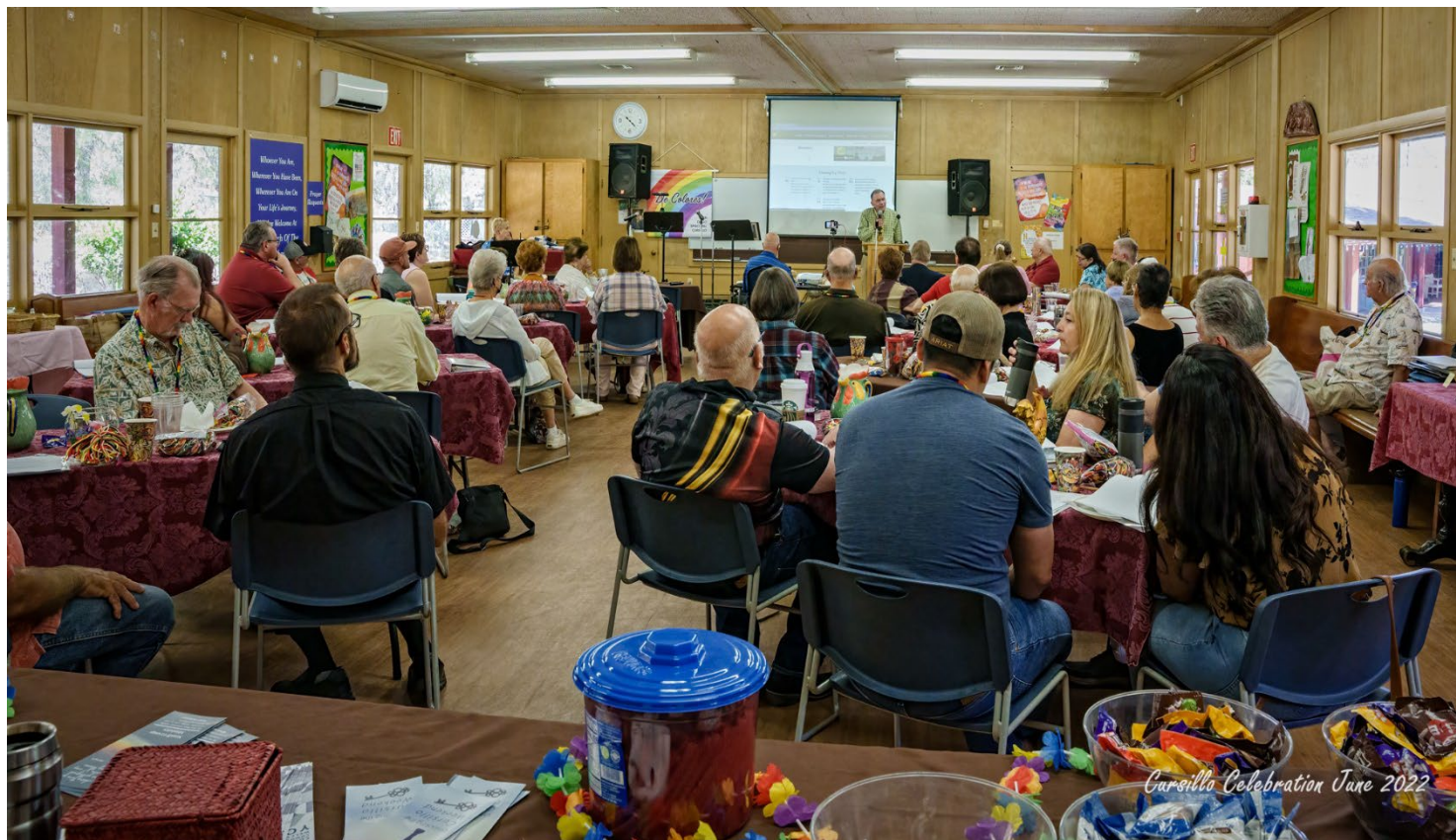
Cursillo Celebration June 2022